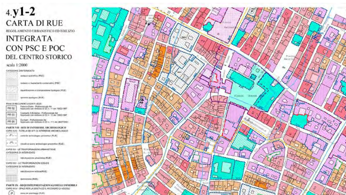
Figure 3. Excerpt from the Regolamento urbanistico edilizio – RUE of the city of Modena, 2013; zoning and regulations of the historic centre.

The action plan approved in 2014 (Piano Operativo Comunale–POC and the related Regolamento Urbanistico Edilizio–RUE) fails to go one step further, that is to say, it neither specifies actions nor adds studies but adopts the usual and well-established practice for conservation: Almost every building in the city centre is subject to restrictive regulations (i.e., the Italian law defining the types of intervention: law 456/1978, art. 31), see Figure 3. In addition to these usual restrictions of transformation, increasing the dimensions of the buildings is always prohibited, as well as the change in use from shops, bars and laboratories into garages [40].