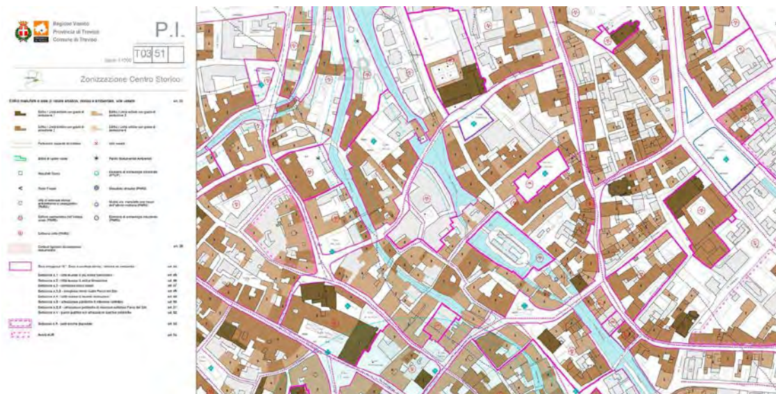
Figure 2. Excerpt from the Piano degli Interventi – PI of the city of Treviso, 2018; zoning and regulations of the historic centre.

population of 117,050 inhabitants (+17%). To answer this future demand, the Piano Regolatore Generale Comunale does not specifically plan the requalification of the stock in the centre [35,36].