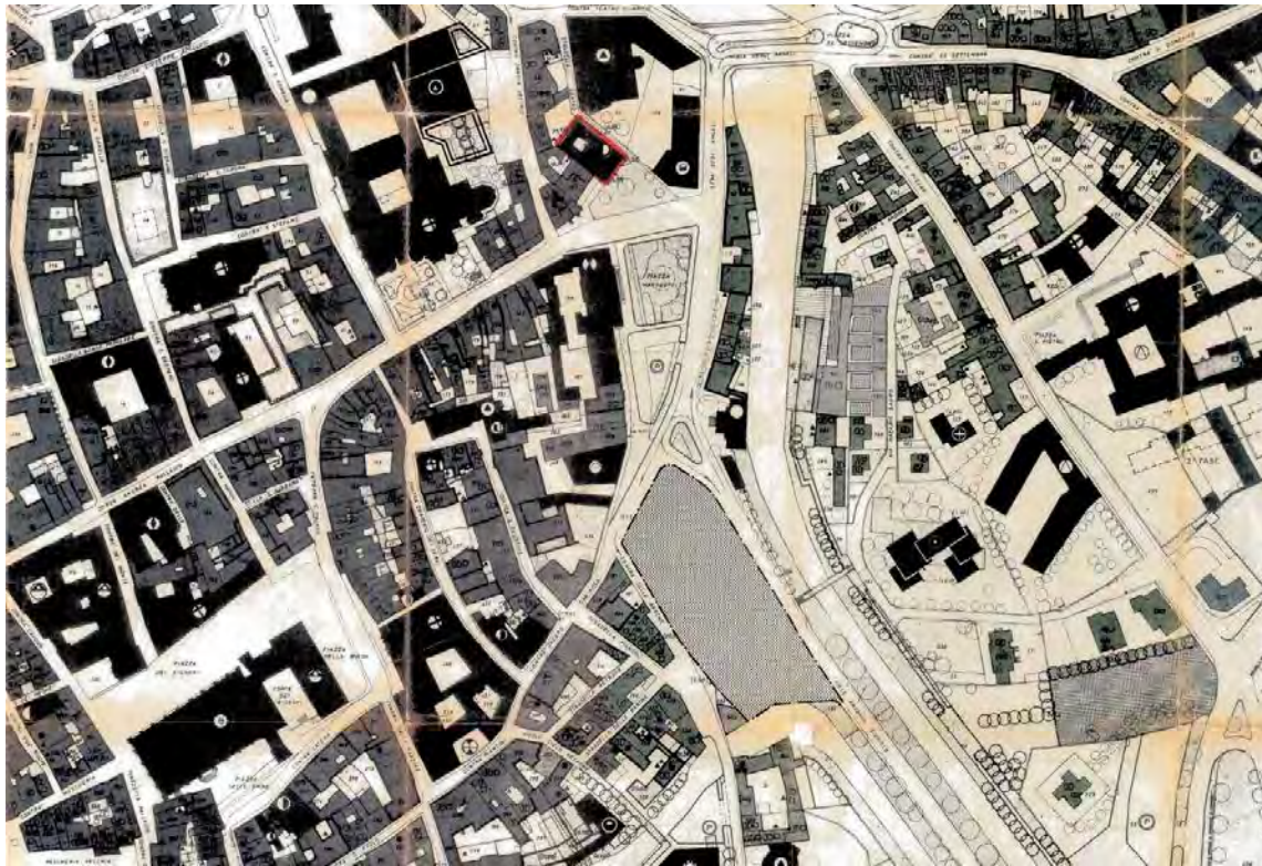
Figure 4. Excerpt from the Master plan of the city of Vicenza, 1969; zoning and regulations of the historic centre.

for the city centre in force (Piano particolareggiato per il Centro Storico – PCS), which dates back to 1979 (but was drafted in 1969, see Figure 4), even though it was partially updated in 1988 [43].