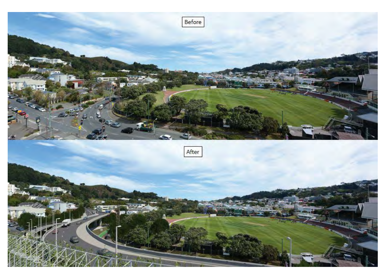
Figure 3 Before and after views of what the Basin Reserve project would look like.

On 25 September 2014 NZTA decided to appeal the Board of inquiry's decision to decline the resource consents and the notice of requirement on the grounds of points of law. On 21 August 2015, the High Court delivered its judgement, which upheld the Board of Inquiry's decision to decline the consents and notice of requirement. Justice Brown determined that the NZTA was unable to establish that the Board of inquiry made an error of law in making the decision they came to. It was then announced on 4 September 2015 that NZTA had decided not to appeal the High Court's decision.