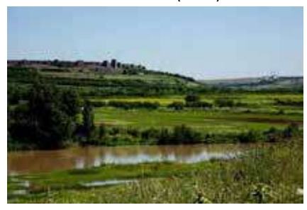
Hevsel Gardens and Fortress (2014)