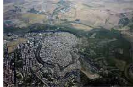
Surici & Hevsel Gardens (2014)