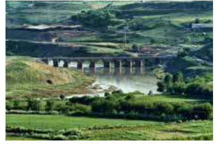
(Map from the site management plan, 2014) Ten-Eyed Bridge (Tuncay Cilasun 2019)

As inscribed in the UNESCO WHL, this heritage site has a management plan, which was informed by community involvement through participatory meetings, cf. Article 108 of (UNESCO, 2005). Records of community meetings are documented in focus group reports and the resulting management plan should in theory reflect the interests, ideas, problems and needs of the people who have a stake on the heritage site. Both documents will be used as a basis to illustrate a proof of concept of the proposed method to assess community knowledge transfer throughout the planning process.