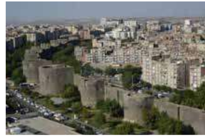
City Walls and Urfa Gate (2014)