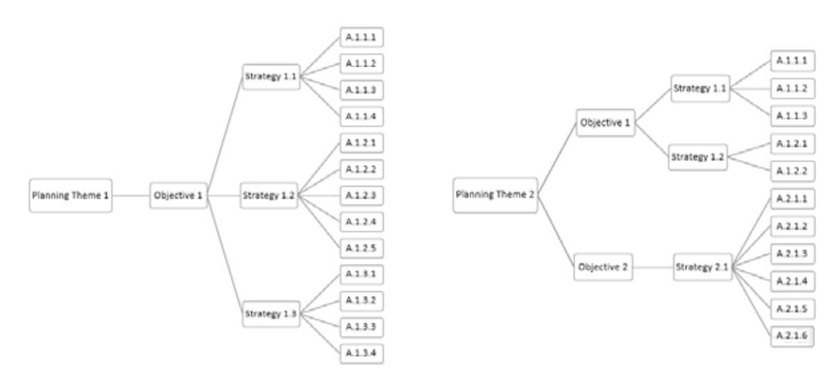
Figure 1: Management Plan Structure

Focus group reports are structured according to a set of themes derived from focus group meetings whereas management plan content is structured according to Figure 1. Each planning theme has a set of objectives, which have a set of strategies with a subsequent set of related actions structuring guidelines for the implementation and monitoring of the management plan.