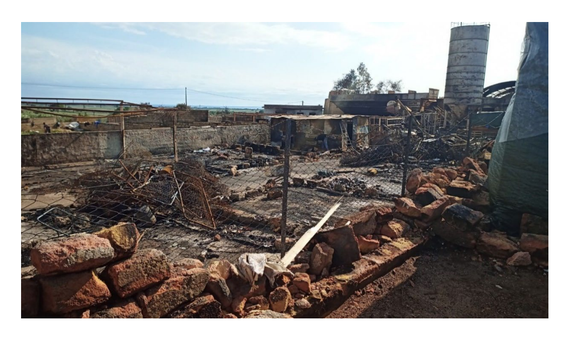
Figure 3 | View of the 'Ghetto' at Ex 'Cementificio Selinunte' Castelvetrano (Trapani province) after the fire.

In particular, a SPRAR (Protection System for Asylum Seekers and Refugees), which has now become SIPROIMI (Protection System for Persons with International Protection and Unaccompanied Foreign Minors), was set up in what used to be the factory offices<sup>1</sup>. In the large car park of the former factory, on one side are housing modules provided by the Sicilian Region that can accommodate a little more than 100 migrants; on the other side is a shantytown, housing those who cannot fit inside the housing modules.