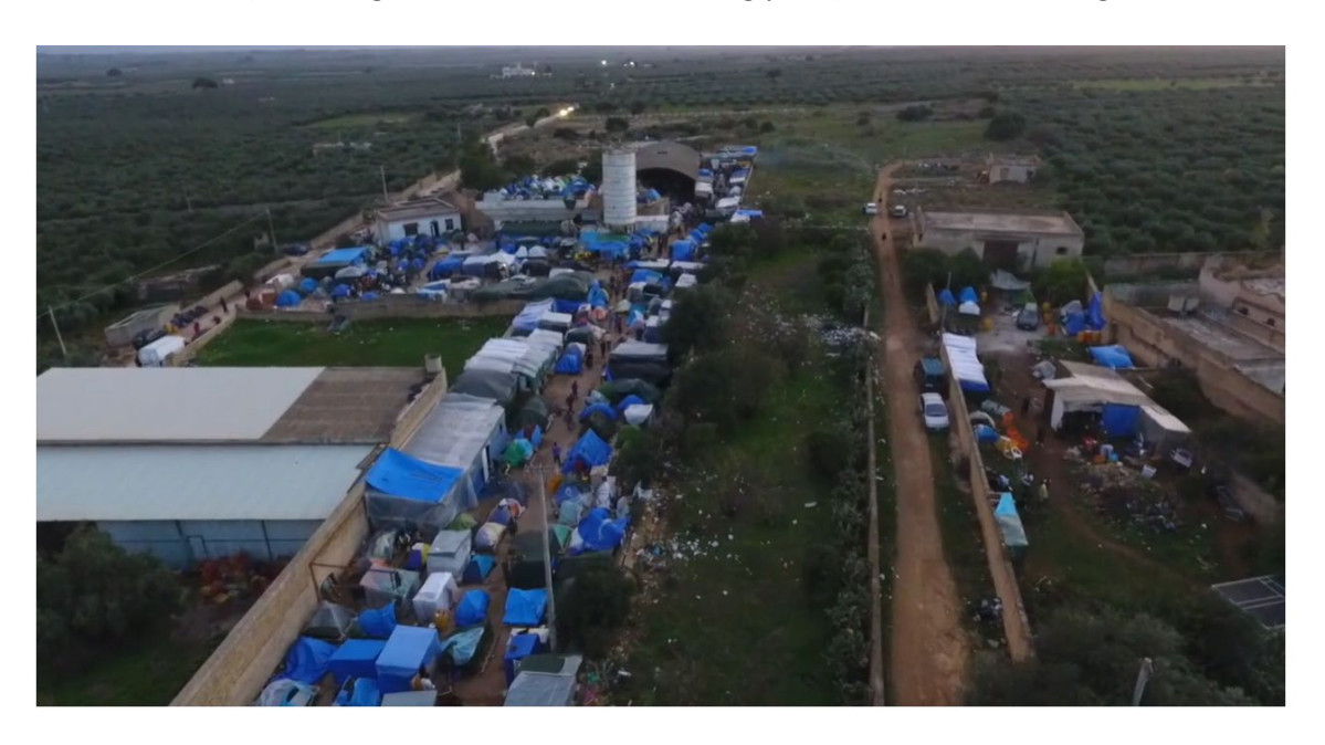
Figure 2 | View of the 'Ghetto' at Ex 'Cementificio Selinunte', Castelvetrano (Trapani province).

The Castelvetrano's 'ghetto' originated in Erbe Bianche's zone as a spontaneous camp, probably between 2008 and 2009 (Lo Cascio, 2019) in which around 700 seasonal migrant workers would gather every year from the beginning of October for the olive harvest. Due to protests from local residents and inadequate sanitary conditions, in 2018 the settlement was abandoned by the migrants (to avoid being reported), before it was cleared by order of the Prefecture of Trapani. The migrants moved to the former 'Calcestruzzi Selinunte' factory, not far from the previous settlement, where around 400 migrants were concentrated (becoming around 700 in the following years) in inhuman housing conditions.