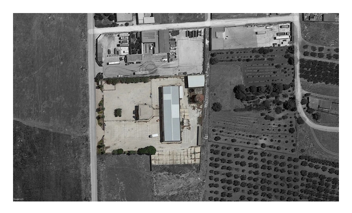
Figure 4 | Satellite image former Oleificio 'Fontane d'Oro' to which migrants were moved after the fire which occurred in October 202.

The outcome of this story is an ambiguous and opaque institutional policy that, on the one hand, moves in the direction of restoring the conditions of legality (through squatters removing, construction of camps, etc.), according to the strict rules of 'reception' (residency permit and employment contract), while on the other hand this policy turns a blind eye to the conditions of illegality (probably incentivizing them at certain times), if they are maintained in full invisibility. The spatial result is the multiplication of camps (institutional and informal) that alternate or coexist, depending on the institutional balances achieved and the migrants' conditions of regularity/irregularity. Within the institutional and political debate migrants have no voice, remaining in the widest invisibility.